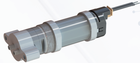
MAC Bullet Valve Pump Patent Pending